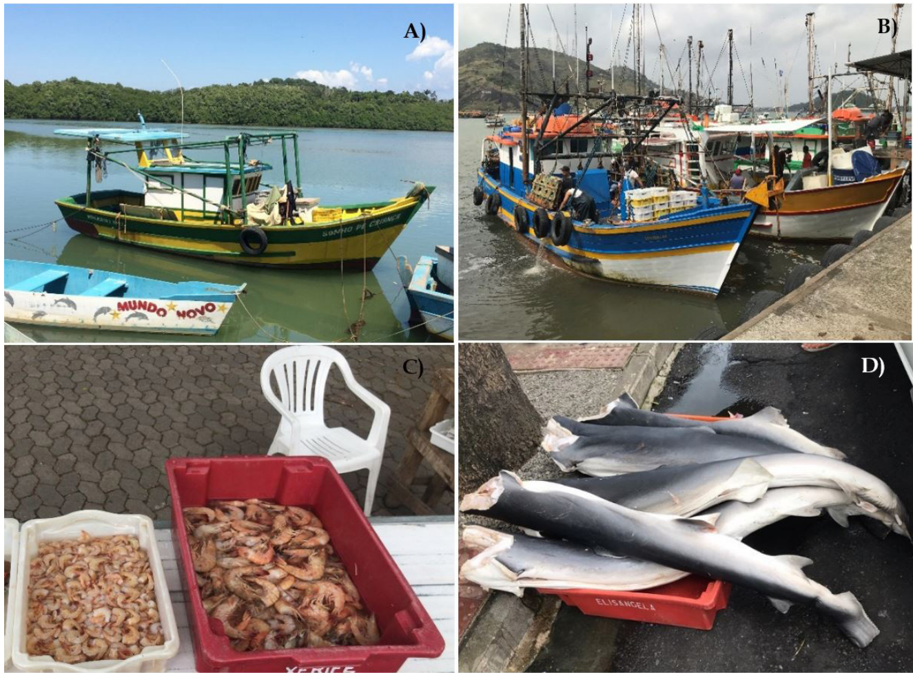
Figure 2. Example of fishing activity in Espírito Santo. Trawled fishing fleet from A) Anchieta and B) Praia do Suá. C) Types of shrimp caught and traded. D) Landed cação.

continental or coastal regions in activities such as cleaning and marketing fish and hunting crustaceans and mollusks (on beaches and mangroves). This is because in addition to fishing practices, domestic activities and children care are also the responsibility of women, which indicates work overload. In the coastal/marine region, although women do not develop activities in the same spaces as men, they occupy an important niche, acting in the aforementioned functions (Manesch, 1995; Dias and Oliveira, 2015; Musiello-Fernandes et al., 2018b; Abreu et al., 2020).